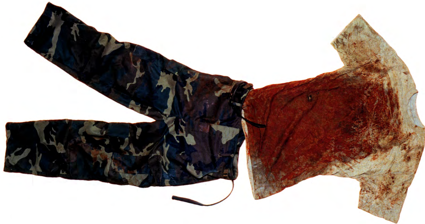
1 : Bosnian Soldier, 1994 © Oliviero Toscani 2 : Children and Potties, 1990 © Oliviero Toscani 3 : Priest and Nun, 1991 © Oliviero Toscani 4 : HEARTS, March 1996 © Oliviero Toscani